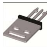
Bent Key V2: