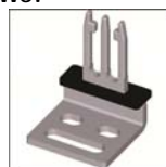
Bent Key V2: