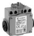
50mm Series Plastic or Metal