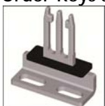
Bent Key V1: