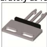
Flat Key V1: