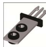
Shock Absorbing Flat Key: