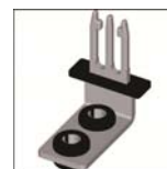
Shock Absorbing Bent Key: