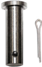
31003-110 12 mm diameter x 30 mm long.