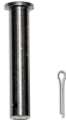
31003-111 10 mm diameter x 45 mm long.